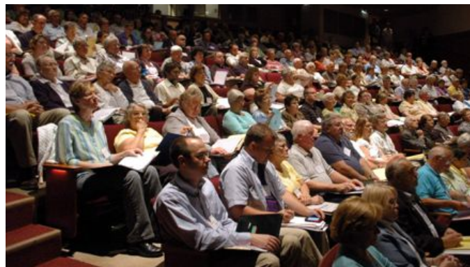
Voting members and guests in Degenstein Theatre