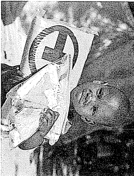
A boy with disabilities who survived Haiti's January 12 earthquake cradles a blanket and Hygiene Kit he received from Church World Service, a member of the ACT Alliance. He is part of a group of disabled Haitians who are receiving special attention from ACT Alliance members.