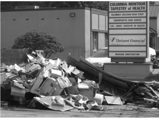
Piles of debris piled outside the Thrivent office in Bloomsburg. That office was another victim of the flood.

In the Buffalo Valley Conference, most communities had little or no damage, except for groundwater in basements. Parts of Milton and Lewisburg received some flood damage. St. John's, Delaware Run ( Pastor Jill Seagle ), sustained damage in their ground floor due to water run-off and Trinity, Milton ( Pastor Cheryl Berner ), removed all items in their basement, fearing flooding when river levels were predicted. Fortunately, the river crested lower than expected and no flooding occurred in the church building. The disaster relief team at Zion, Turbotville ( Pastor Erwin Roux ), helped an elderly woman whose home sustained major damage. Christ, Milton ( Pastor Pat Pittsnogle ), also helped a congregation member who sustained major damage on Front Street.