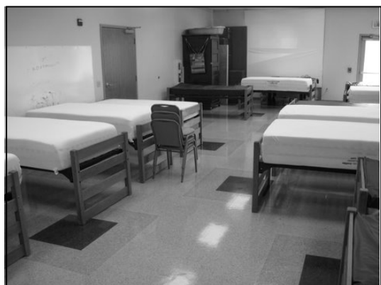
Beds set up at St. Luke, Bloomsburg, for volunteer work crews.