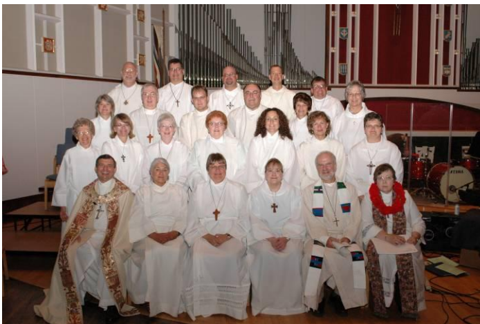
2009 Graduates of the Lay Ministry Institute