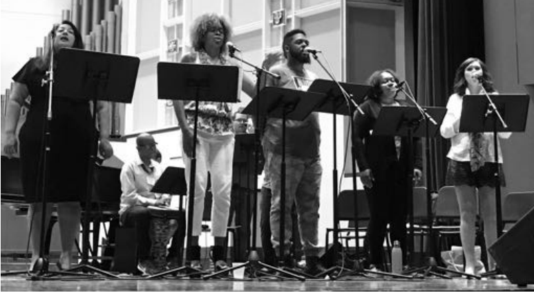
Members of an ELCA Glocal Team sing during Synod Assembly. The team provided music from across the world.