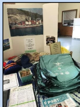
Seafarer's "Christmas-at-Sea gift bags

Life today is no longer simple; home vegetable gardens have largely disappeared and been replaced by swimming pools; foods are imported so we can have out-of-season fruits and vegetables year-round. Clothing labels tell the tale of foreign manufacture as do some car models. We rely on other people to fulfill our needs. Among these unsung heroes are the seafarers who bring container ships to port, man oil tankers ... and risk their lives for us. Ships have been overtaken by pirates and crews imprisoned for months at a time; other ships have capsized or caught fire and had to be abandoned, with loss of life. In just 22 days last January, 33 seafarers lost their lives in ship disasters, some of which might have been prevented with improvements in ventilation and more control over container contents.