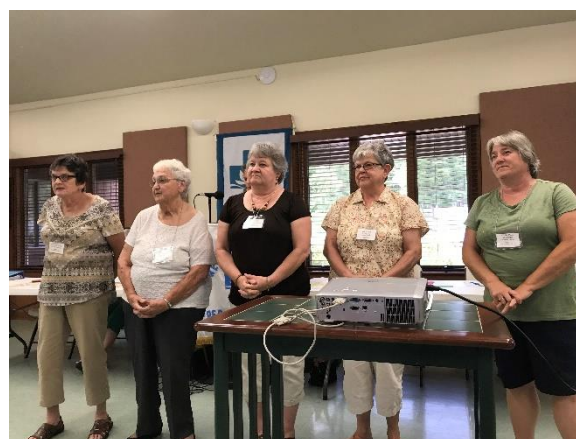
Newly-elected members of the USSWO Executive Board