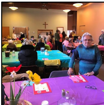
The people in the fellowship room, waiting for the Fashion Show to begin