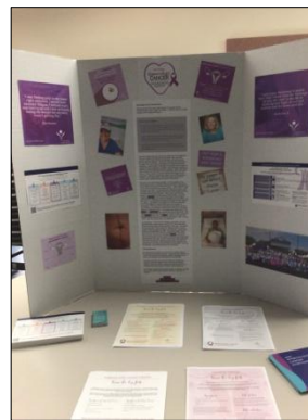
A Cancer Survivor's Story