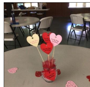
A table centerpiece on the Convention theme, "Love One Another"