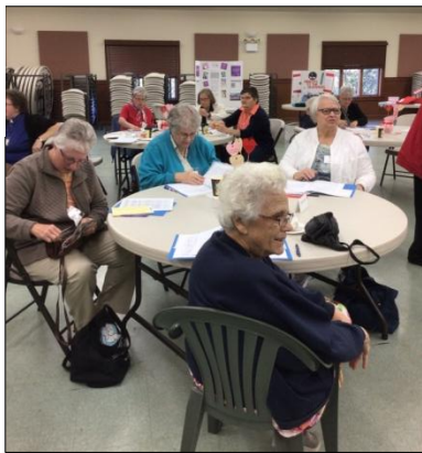
Delegates and Visitors during the Business Session