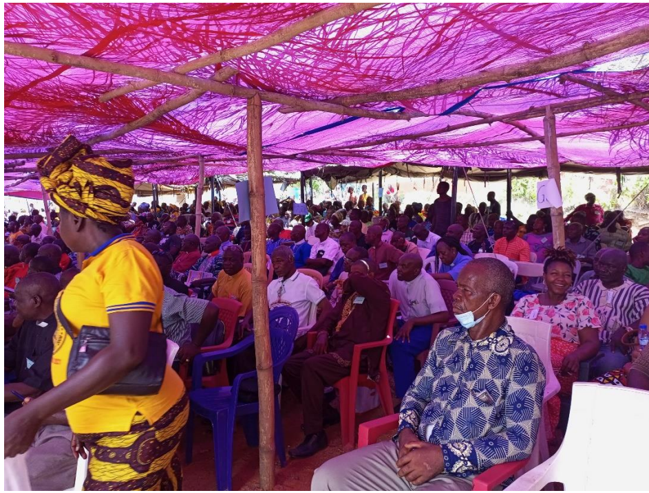
LCL Convention 2022