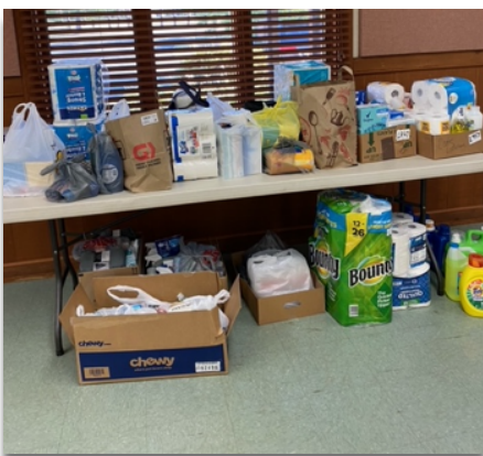
In-kind donations for Lewistown Shelter