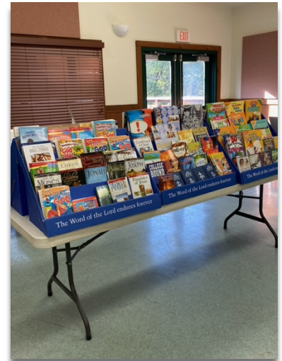
Along the Way Bookstore