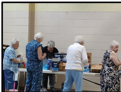
Filling the Period Packs